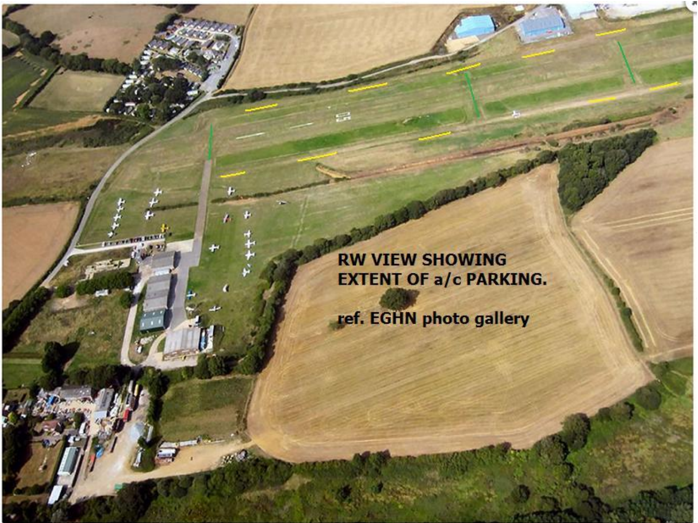
RW VIEW SHOWING EXTENT OF a/c PARKING. ref. EGHN photo gallery